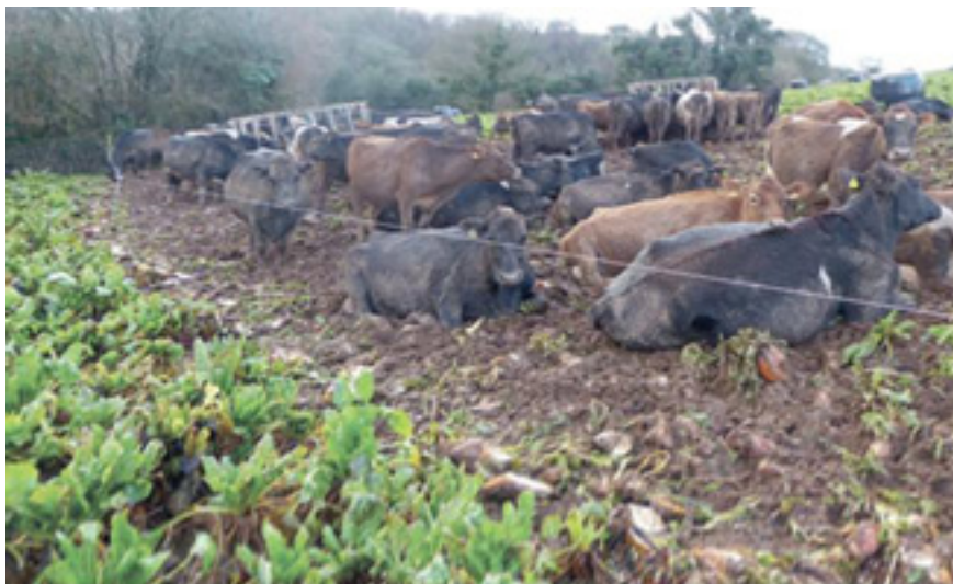
Out-wintering and the grazing of winter forage crops can cause soil erosion and soil loss on trampled banks

Vehicle traffic when supplementary feeding livestock is also a common cause of soil compaction which can also lead to soil erosion.