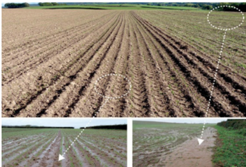
Pressed soil in a seedbed that is slightly too wet can cause compaction along wheel marks and subsequent runoff and soil erosion