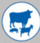
Animals (including welfare and identification)