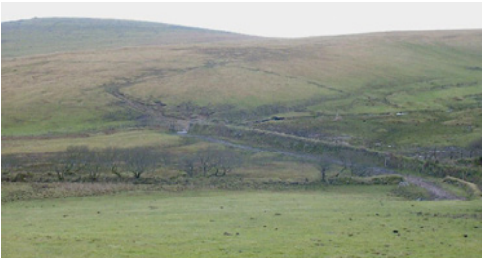
Out-wintering, supplementary feeding of stock, and use of sacrifice fields in upland areas can cause soil erosion.

Supplementary feeding and the use of tracks, particularly on slopes and next to watercourses, can increase the risk of erosion.