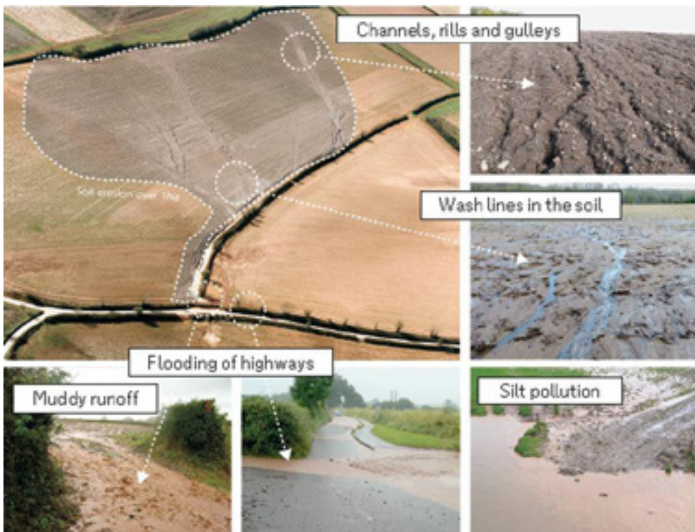
Signs of erosion