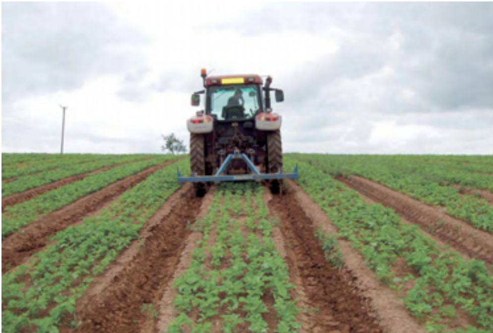
Compacted wheel ruts in light soil can be loosened where this does not interfere with crops